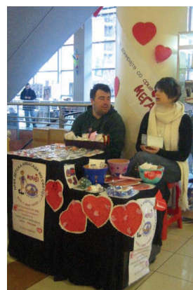
Embassy's exhibition space in Ramstore Mall

Special thanks to Ramstore Mall for supporting our actions and for the free space, and to fast food Amatti at the Ramstore mall (3238-144) , for providing sandwiches for the volunteers from Megjashi who took part in this action.