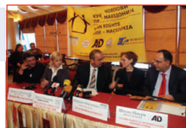
Press conference at the Stone Bridge Hotel