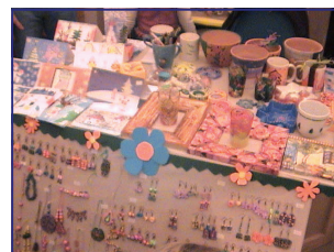
Fair of Hand made Cifte Amam

Strumica, at the International NGO bazaar in Gostivar , and at the New Year's fair in Skopje Fair.